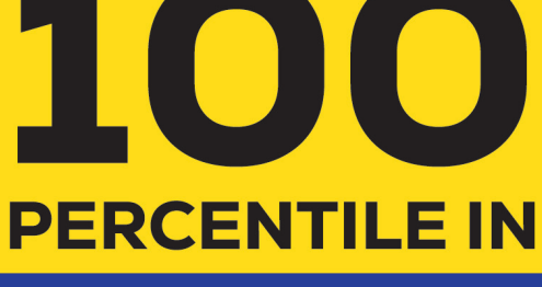
PHYSICS CHEMISTRY AND MATHS