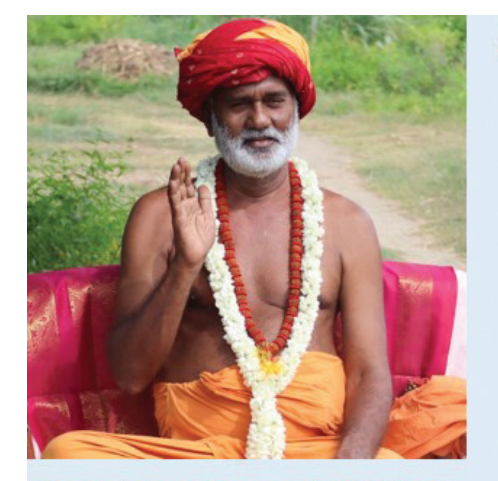
YouTube @vaasi siddhar